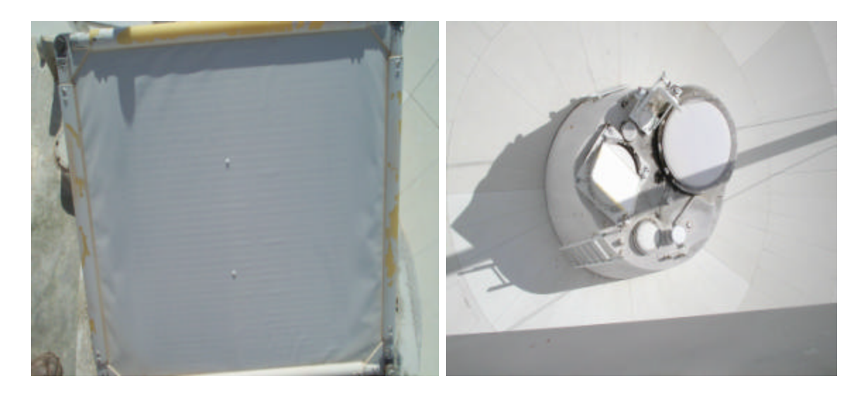
The dichroic reflector is delaminating. View of feed cone and dish panels.