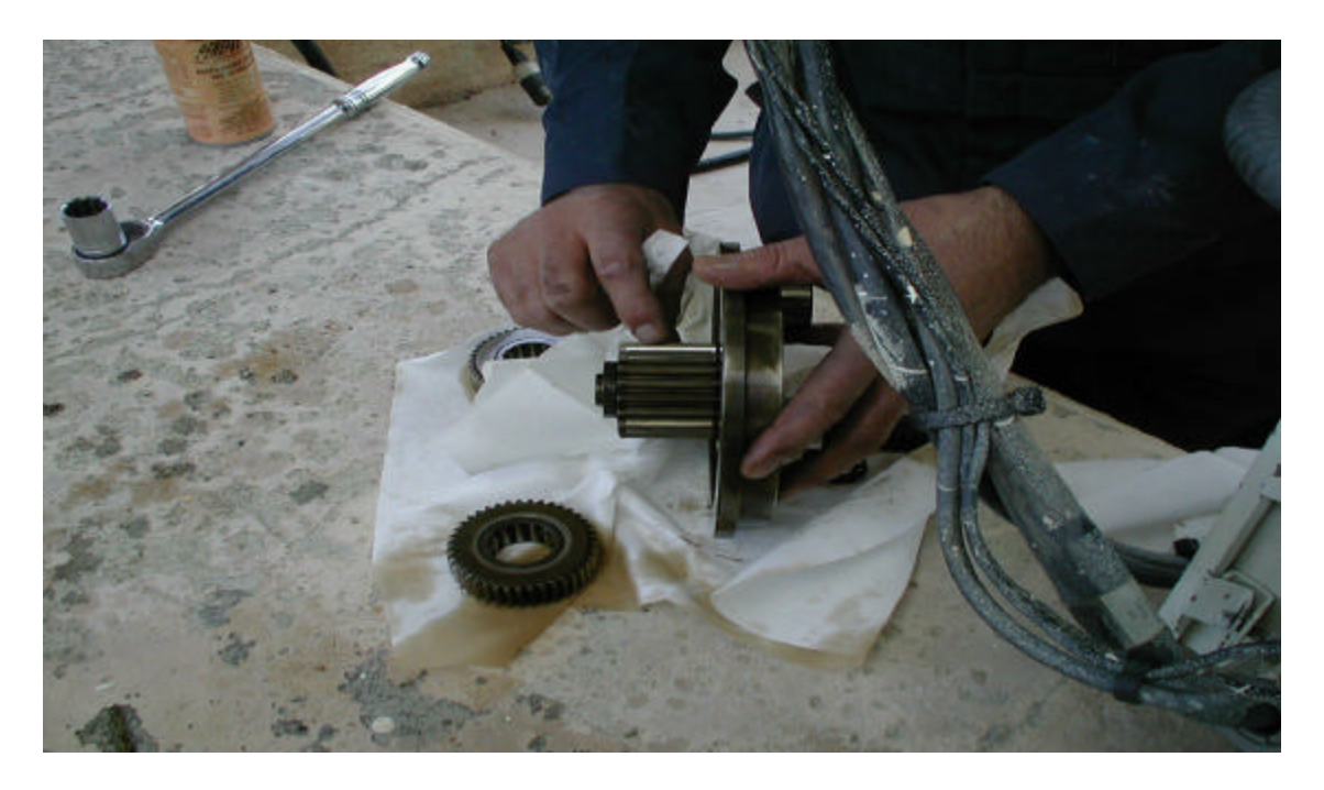
Azimuth #1 gearbox pre-load inspection.