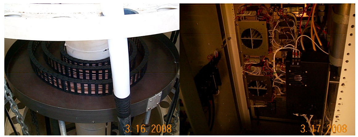
The new IF Cable Wrap was installed and tested. The Site Techs had to install the new drive cabinet power supply shortly before the maintenance team visit due to a failure.