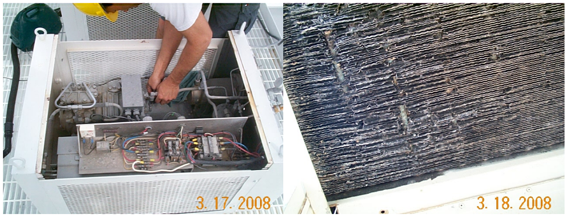
Both CRYO compressors were inspected and are in good condition. Both Contempo condenser coils are deteriorating and will need replaced.