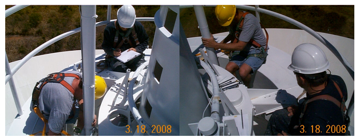
The FRM was given a thorough inspection and the 6 month PM was completed. The focus flex shaft will need replaced in October.