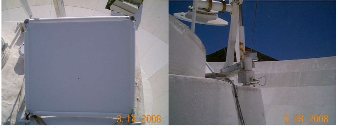
Dichroic reflector is in good condition. Ellipsoid reflector is in good condition. Dichroic reflector actuator operates correctly.