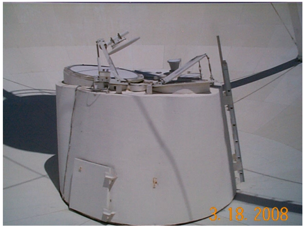
Dish panels are in good condition. The feed cone's elastomeric paint is holding up well.