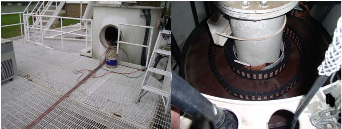
The new IF Cable Wrap was installed and tested.