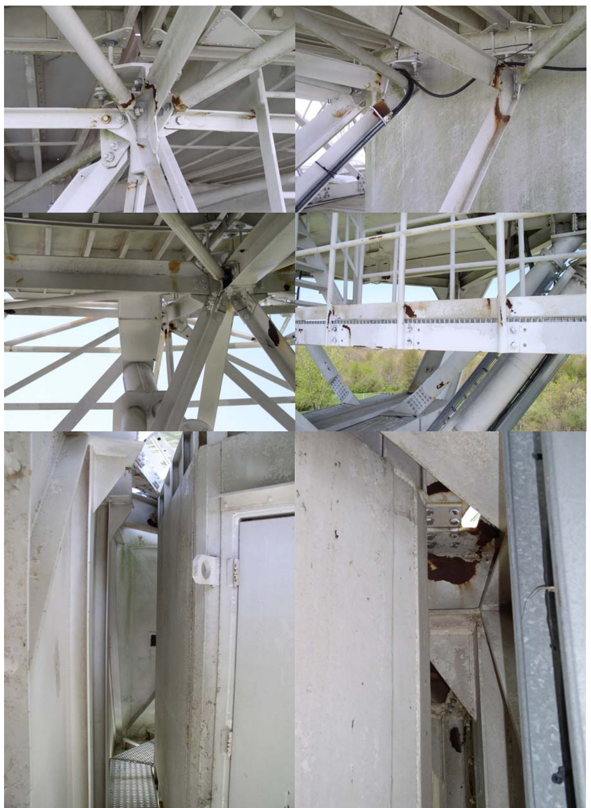
The Antenna could use a paint job. Paint is flaking off and surface rust is affecting most of the Antenna structure.