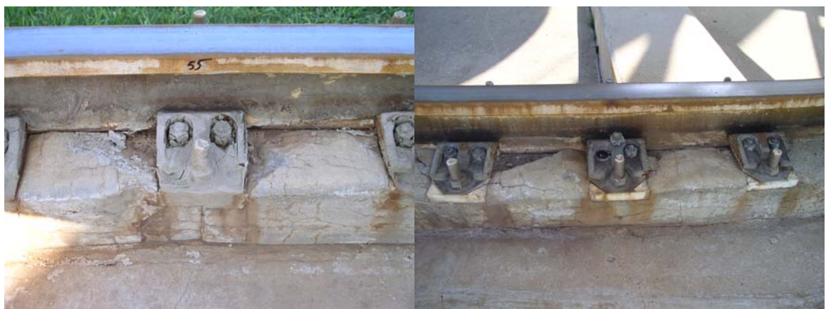
Grout has deteriorated from under the rail at bolt numbers 55 and 54. Rail clip bolts are broken at 34, 39 and 54.

Grout is cracking and has fallen out at both ends of this rail splice. Bolt numbers 65 and 62.