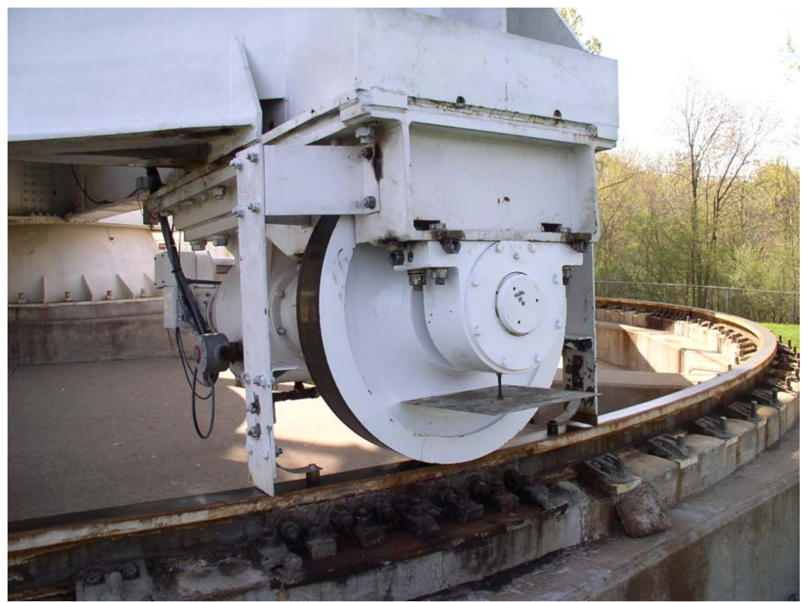
Azimuth #1 Wheel assembly was replaced. The new drive wheel assembly rotated smoothly without any popping or grinding noises.

MEASUREDSPECConic Radius299.893300.0Coupling Runout.001<.0</td>Vertical93.46393.44Horizontal.004<.0</td>