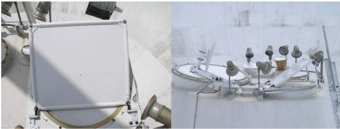
Dichroic reflector is in good condition. Ellipsoid reflector is in good condition. Dichroic reflector actuator operates correctly.

Dish panels are in good condition. The feed cone's elastomeric paint is holding up well. The feed cone was sealed and painted back in 9/2003.