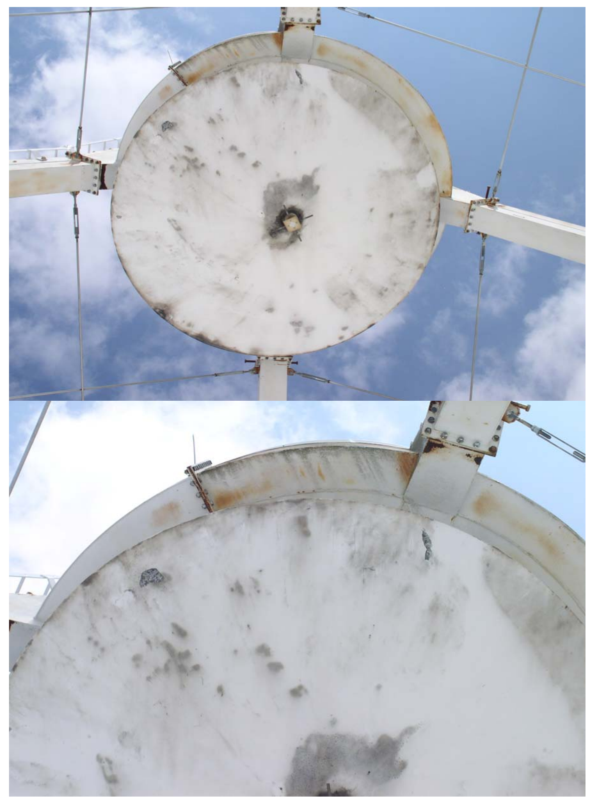
Sub reflector paint is beginning to flake off. FRM was given a thorough inspection. The focus flex was replaced. The FRM is well lubricated.