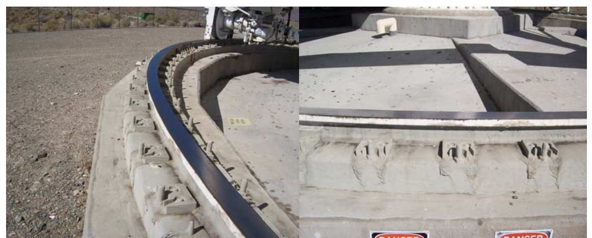
The Owens Valley rail is in good condition. The vulchem still looks as though it has been recently applied.