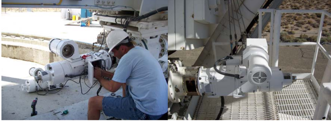
Azimuth #1 and Elevation # 2 motors were both replaced.

The Dichroic reflector is in excellent condition. The Ellipsoid reflector is in good condition. Ellipsoid actuator operates correctly.