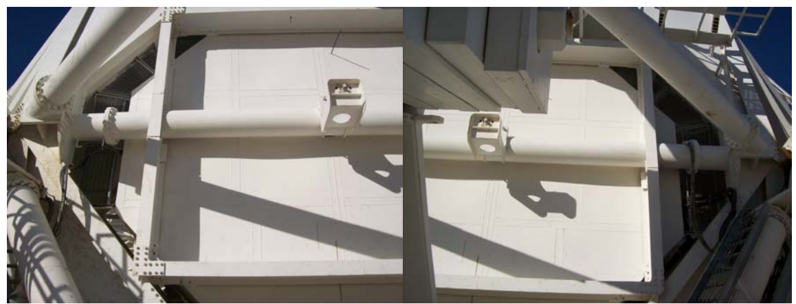
Elevation axle has no visible signs of cracks. Paint is in good condition.