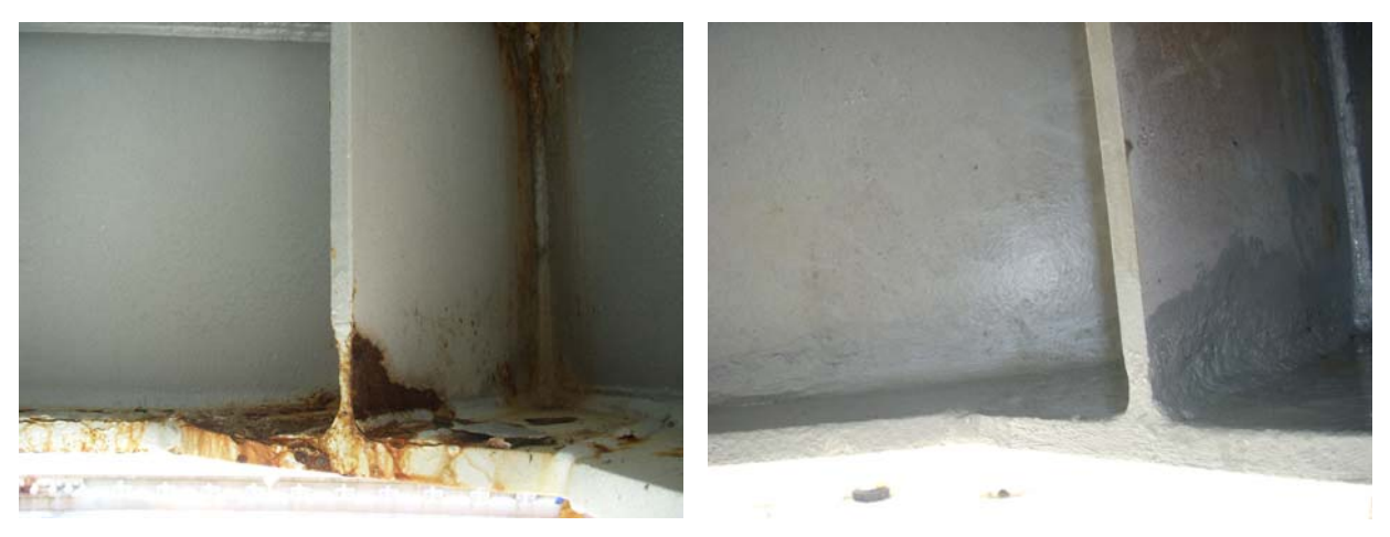
Shown above is the area where water gets trapped below the pintle bearing pocket.

Locations that showed significant corrosion were repaired by needle scaling the existing rust and then applying aluminum filled epoxy by brush. The pictures below show some of these repair locations.