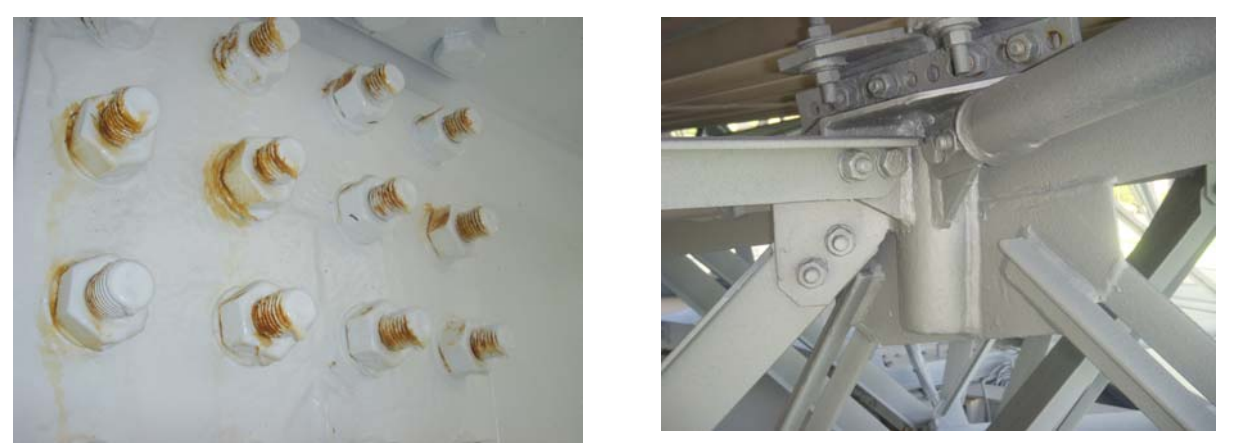
There is some rust staining on the bolt heads and nuts on the lower portions of the structure. However, this staining is not nearly as prevalent in the upper backup structure. The reason for this is that the backup structure had significantly more surface preparation and a more robust paint job than the remainder of the antenna. Since the corrosion was most prevalent and destructive on the upper backup structure, we focused our efforts on this part of the structure in 2007. This included more thorough surface preparation, the application of an organic zinc primer and additional paint application by brush at the connections. Another VLBA Antenna Memo focused entirely on the painting and paint system performance will be issued in the near future.

The inside portion of the truss structure under the dish was left unfinished during the 2007 painting due to time constraints. This part of the structure was primed with organic zinc epoxy and then coated with aluminum filled epoxy in 2007. During this visit, all of the bolts and places which showed signs of corrosion were stripe painted by brush with aluminum filled epoxy (Amerlock 400AL) before the final topcoat of Acylic Polysiloxane (PSX 1001) was applied. A small section of this structure was topcoated with aliphatic acrylic polyurethane gloss (Benjamin Moore P-74) in order to compare the performance of the two topcoats.